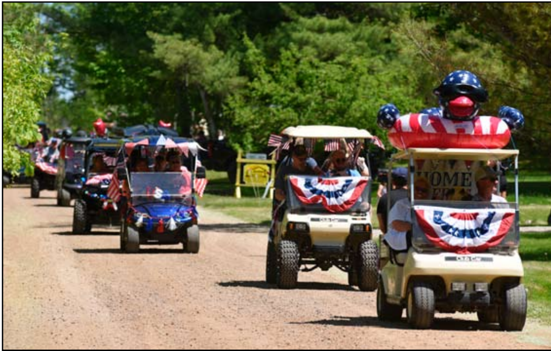
The first ATV/golf cart parade heads down Hardwood Heights Memorial Day weekend.