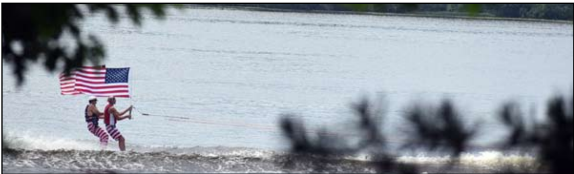
A great start to the July 4th boat parade.

(Editors note: The above article was posted on the lake association Facebook page in early June to reach as many residents as possible.)