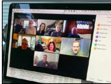
The Lake Association board met via Zoom in mid-May.

The COVID issue should not affect this year’s weed control project. Lake engineer