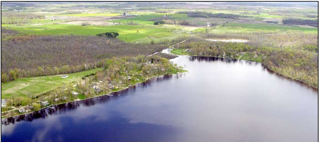
An aerial view of the north shore and east end of Hardwood Lake.