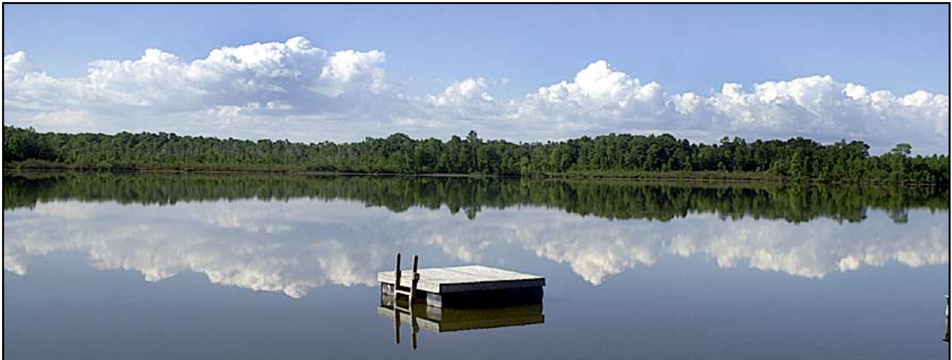
A still morning in early July on Hardwood Lake.